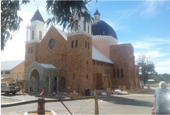
The Divine Mercy Catholic Church, Lower Chittering